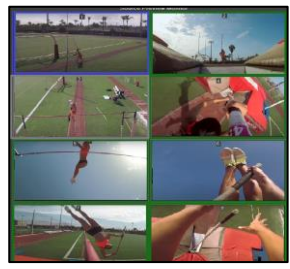
Multi-View Monitor Single Screen

Play back multiple videos taken from different angles or at different times—displaying up to 8 different views on a single screen or on multiple monitors.